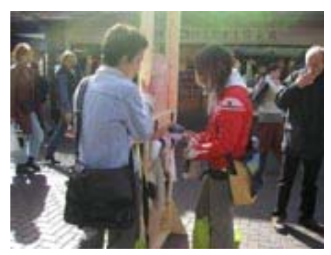
Act 2- Do you want tot manipulate for a change? 2002/3, Rotterdam

I realized at an early stage that if I am beside the 'theatre' passersby feel they should be guided through the experience, which would mean further direction from my part.