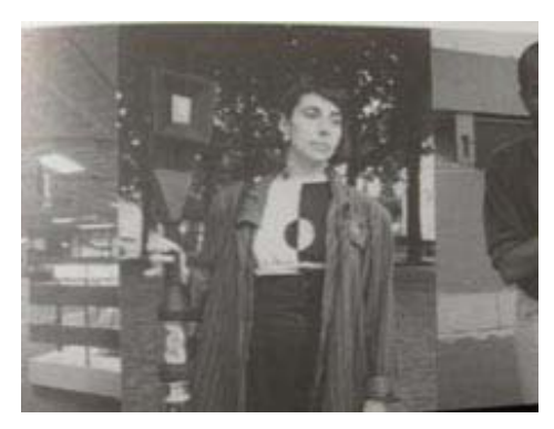
Alien Staff (1992/96), Wodiczko

Am I empowering the passerby through Act 2 ? I will refer to the work of Wodiczko, Alien Staff (1992/96) to better explain my position. The Alien Staff is a portable "public address equipment and culture network" for individuals and groups of immigrants. It is an instrument through which the individual immigrant can address directly passersby in the city who might be attracted by the "symbolic form" (http://www.v2.nl/n5m/people/wodiczko_alien.html – 11/28/02) of the device.