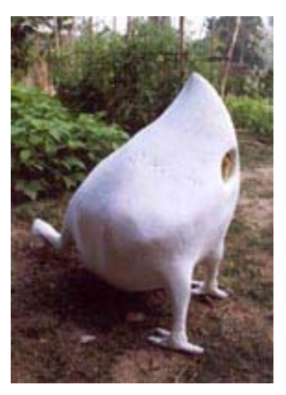
Chicken, 1999, Porto

I have always searched for strategies to involve the audience more in my artwork, seeking to restore 'experience' and interaction, in my artwork, against mere contemplation. In previous work that came into effect by the use of intimate media and playing with the viewer's senses. My soft sculpture and tactile work are a direct example: Chicken (1999) – a meter high plaster chicken, placed in a public garden, in an eating position. With a hole in the back, inviting the public to place the hand inside the chicken's ass. This process of developing a project as a shared dialogue between the artist and the viewer/participant is also evident within the groups I am involved, such as: ZOiNA, a feminist collective of artistic practice based in Porto, ROOM an artist run space based in Rotterdam and CLANITICA an artist collective formed during my stay in Rotterdam.