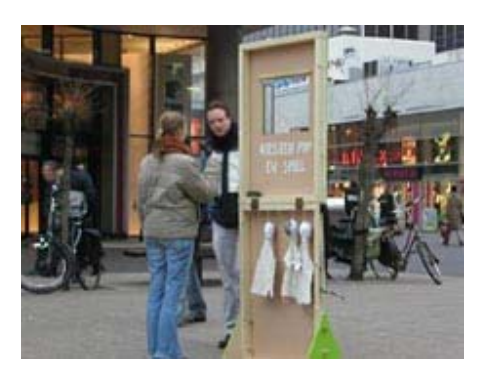
Act 2- Do you want to manipulate for a change? 2002/3, Rotterdam

The audience is invited to play on this puppet show, to reverse roles, to control, to speak, to make a speech, to give an opinion, to release fears and emotions, to be a master. In the meantime, making us laugh, and laughing themselves. Despite the dimension of the challenge, children attempted to play, had fun and questioned their parents; the parents then had to explain and think themselves on how to conceptualize things, what was it all about. An example is the staging on 'Pretorialaan' when "it became a bit didactic for curious children, a reminder (of the war) for some, and almost monumental for others that recognized in the structure a sort of symbolism to those who are against the war." (report 22<sup>nd</sup> March). Adolescents showed their excitement for having a place to try out publicly their opinions, and show their 'voice' as when " a teenager put up a whole theatre play for his friends making a lot of people gather around" (report 20<sup>th</sup> March). Adults let themselves go with the pleasure of playing, representing, manipulating, stating their opinion, and reasoning. On the 31<sup>st</sup> of March "the first to players were two friends, middle –aged women" that without other invitation than the platform itself, engaged in playing for each other amusement (report 31<sup>st</sup> March), comparing what is depicted in the media, and these puppets hanging there, harmless and hopelessly vulnerable, at their disposal, for manipulation.