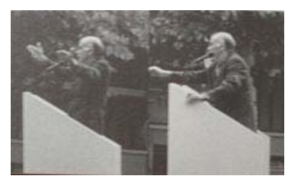
Vehicle - Podium, 1977/79, Wodiczko

In projects such as the vehicle Podium (1977-79) a platform in the shape of a pulpit, on wheels, the strength of an orator's voice controls the speed of the locomotion. It takes the same energy to make the vehicle move as to address an audience. "The vehicle is propelled by an electric engine and moves in one direction only". (Wodiczko, 1999, p.77). Is this because the political speeches move also in one direction only? Or are directed towards something, not really a dialogue or a place to raise critical thinking, but to convince that this is the right way, and the only way? This mobile podium is like a speakers corner on wheels. This corner, in Hyde Park in London, always inspired me as a place of provocation, where anything can be said. Also on this platform, symbolically anything could be said.